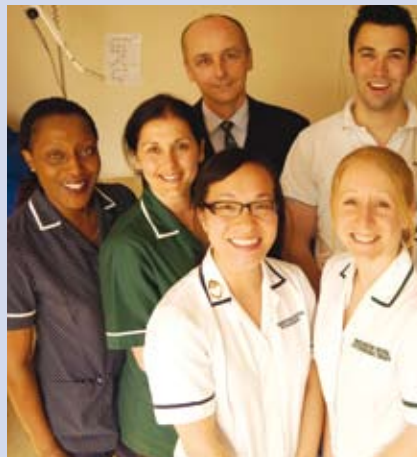
A Rehabilitation Team