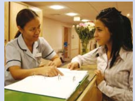
Members of the Gynaecology Team