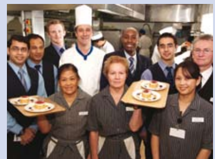
Catering and front of house staff