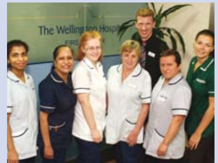
One of our specialist Nursing Teams