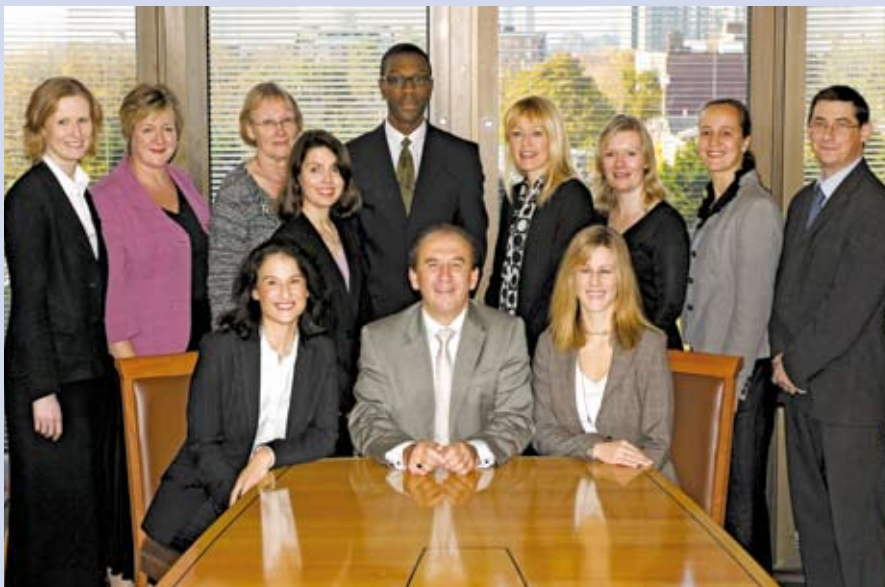
The Management Team