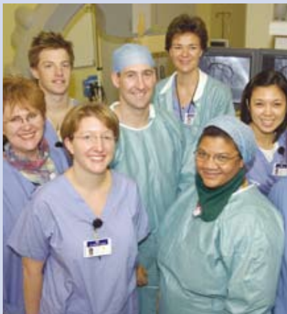
One of our Cardiology Teams

We have some of the most experienced specialist staff in the UK together with those with non-medical skills on whom we rely to make The Wellington run smoothly for the benefit of all our patients. We strive to help members of staff – our Wellington People – to develop their careers and their skills. We would like you to meet some members of our team.